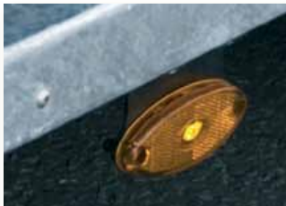
LED side marker lighting Best illumination and reliability (OAL > 6.0m)