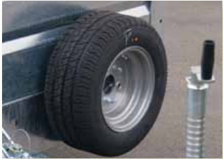
Spare wheel Supplied with all CarGO trailers