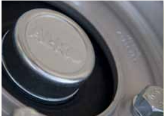
Heavy duty bearings Sealed wheel bearings for reduced maintenance