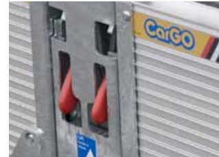
'Auto-LOCK' Aluminium sides feature a brand new integral locking system with slam-shut facility