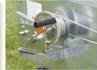
Powerful winch Manual winch has a central pull position and a 2.25t cap