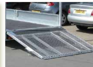
Loading Gas spring assisted mesh panel for the easiest loading operation, or a pair of heavy duty aluminium loading ramps

Publication ref. BJT_UK_COMP_FLATB_2012_1