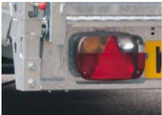
Protected lighting Full EEC directive approved light system is well protected by the strong chassis surrounding the units.