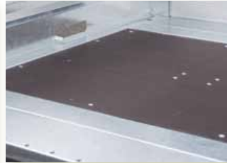
Reinforced flush floor 18mm commercial ply deck with steel and central deck support