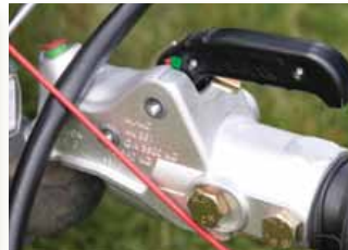
Locking head Integrated lock in cast coupling head. Additional security items available