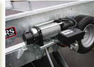
Electric winch Available in a range of sizes. Power by onboard battery pack or HD vehicle power loom