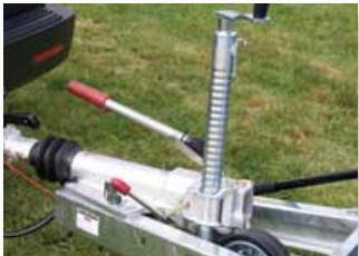
Jockey wheel Heavy duty, fitted as standard