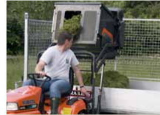
High mesh sides Removable 0.8m high side mesh extensions, all around