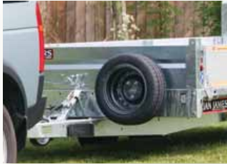
Chassis Unique design fabricated chassis with a 5 year chassis warranty