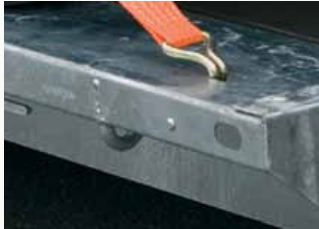
Strap points and hooks Multiple attachment hooks for securing loads inboard with ratchet straps and rope hooks