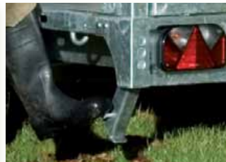
Kick-down supports Easy operation, (standard on flat-bed with ramps or loading ramp panel)