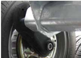
Progressive suspension Independent suspension offers superior ride characteristics and long-term durability