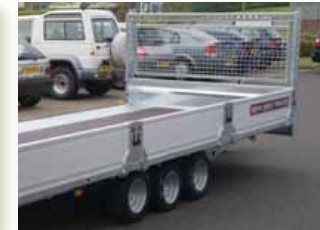
Drop-down sides Fully removable for flat-bed use, either in lightweight Aluminium or galvanised steel