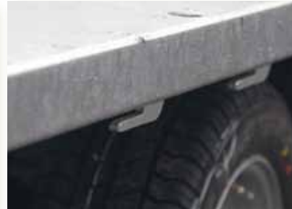
Side system prepared All trailers supplied with pre-prepared hinges for retro-fit optional sides