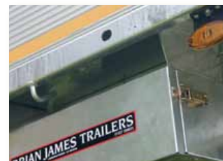
Under side locker in galvanised steel, ideal for keeping straps and tools on the trailer